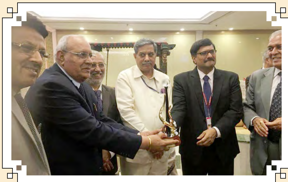
MHRD India Ranking 2019 Award Ceremony