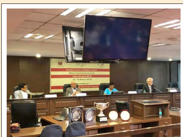
India National Rounds of the 'International Criminal Court Moot Court Competition'