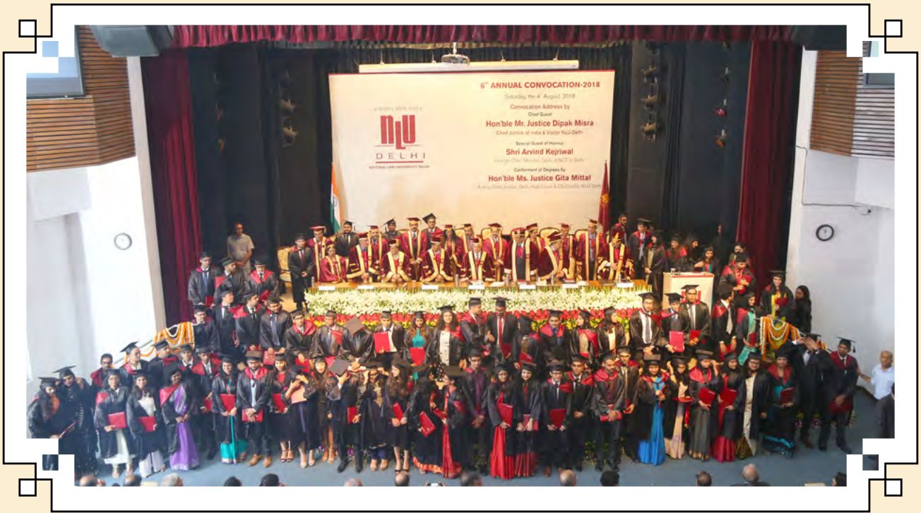
6 th Annual Convocation-2018