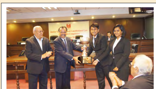
'Justice Y. K. Sabharwal Constitutional Law Moot'