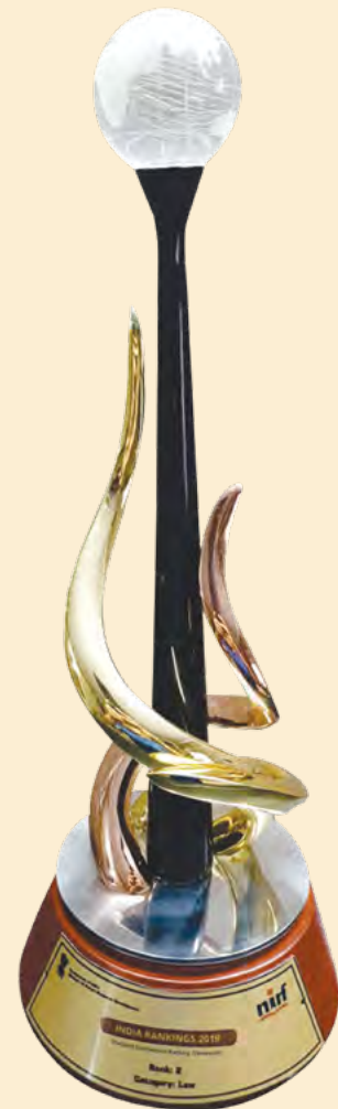
NIRF Trophy 2019