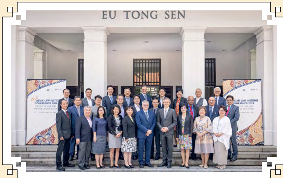
ASLI Conference-2019 National University of Singapore